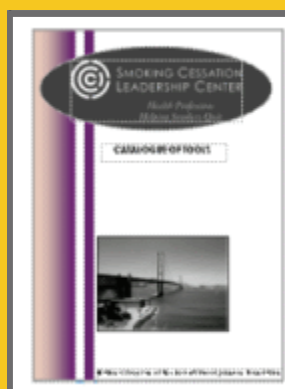
SCLC Catalogue of Tools